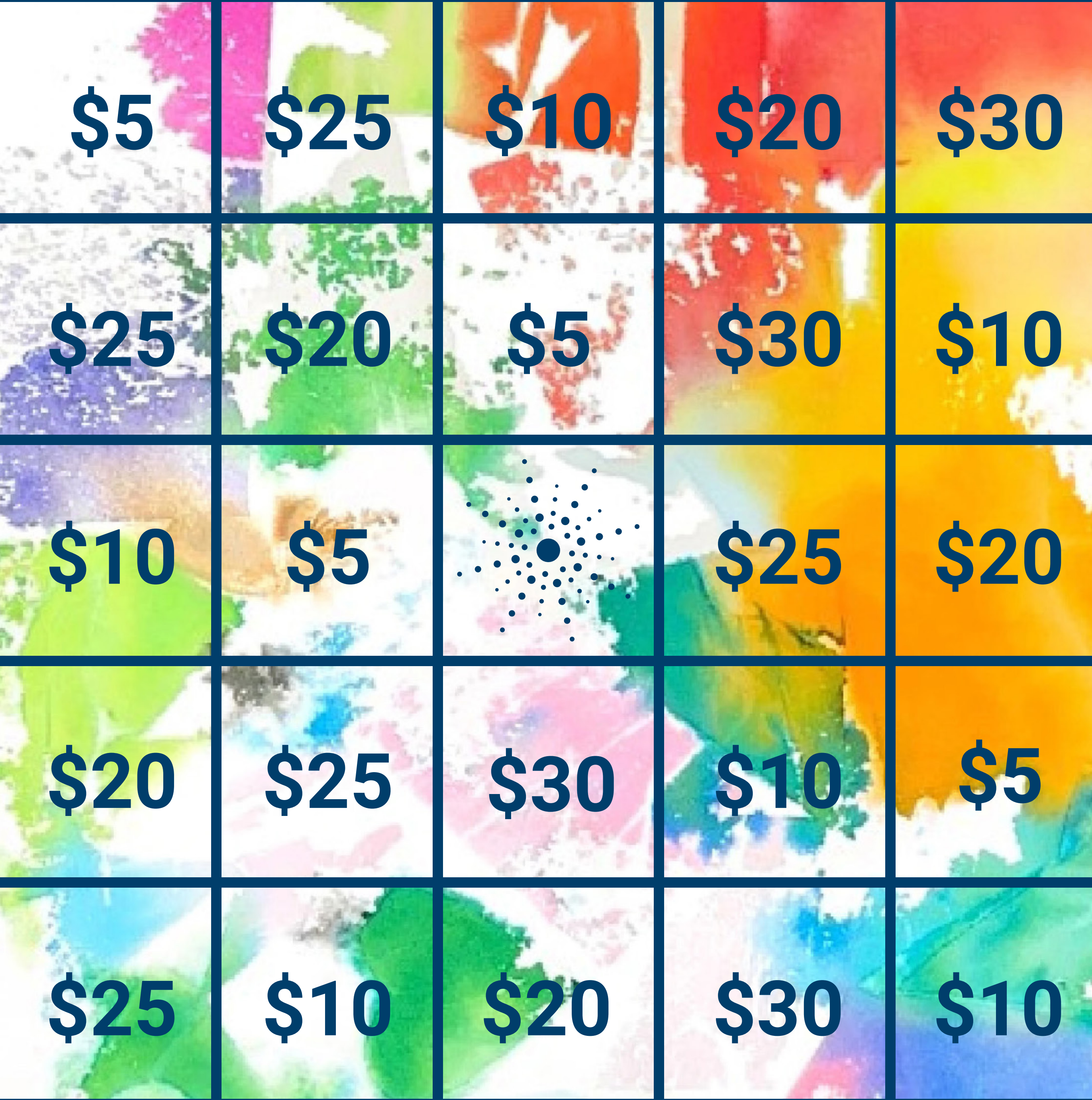
Art by Easterseals Northern California Participant

Help me fill my BINGO card by donating a listed amount to be added!